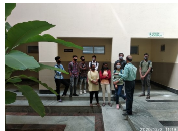
1st year students with Civil Engineering Department on Orientation